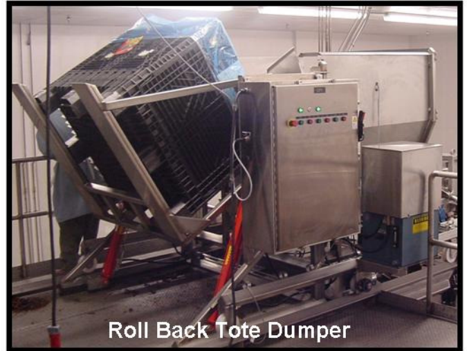
Roll Back Tote Dumper

GIVE US A CALL FOR ALL OF YOUR TOTE DUMPER NEEDS.