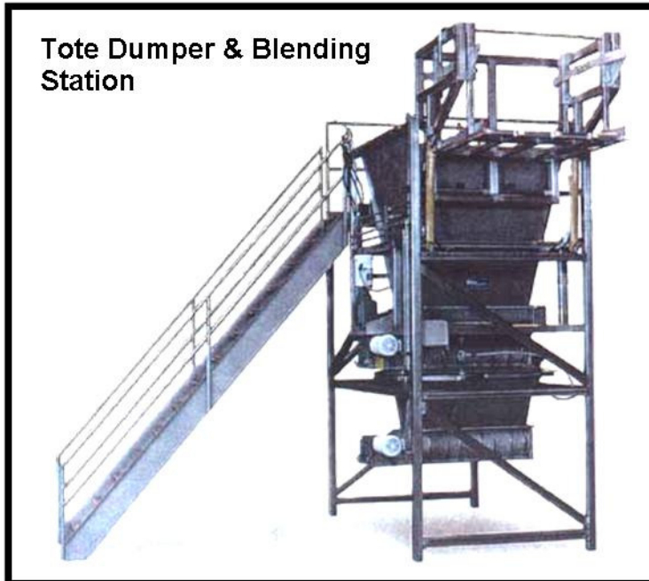
Tote Dumper & Blending Station