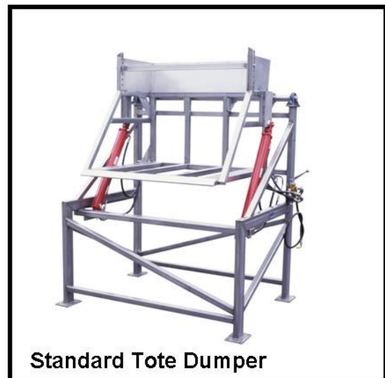
Standard Tote Dumper