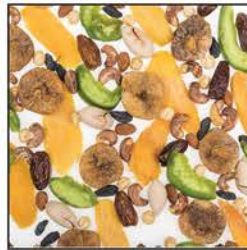
Fruit, Nuts & Seed Processing