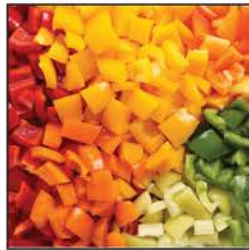
Fresh Cut Vegetables