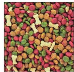
Dry Pet Foods